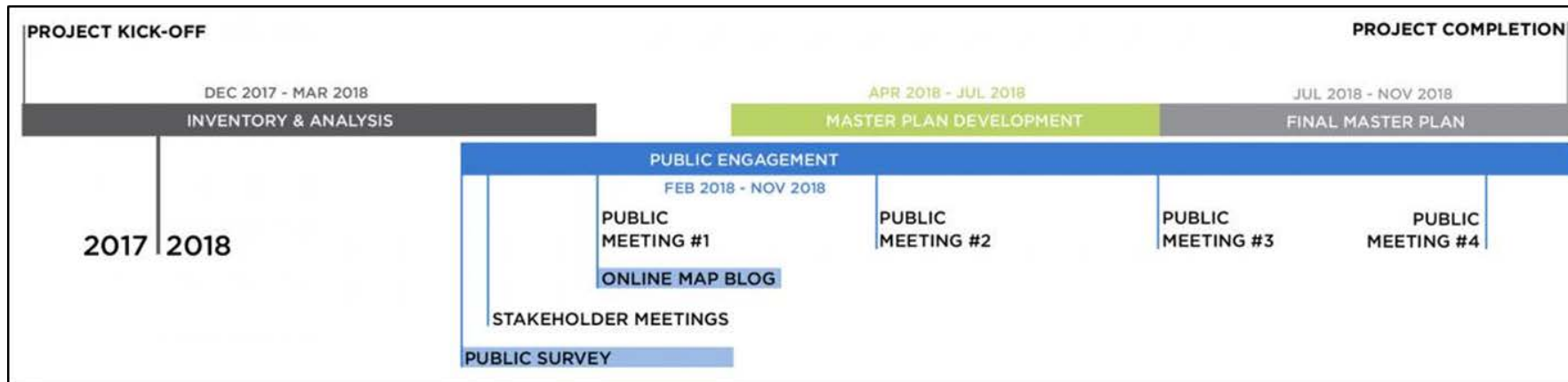
EXAMPLE: Walter E. Long Master Plan Project Goals and Timeline